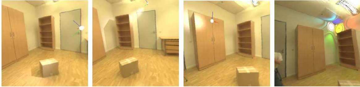
Figure 4: A new light is inserted and can be moved and rotated interactively by the user at 12 fps. Note the shadows of real objects on real objects. The right image shows an artificially generated light goniometric with different colors, stored in one cube map.

the light vector by subtracting the pixel position from the light position and uses the standard cube mapping equations to select the corresponding pixel from one of the sides of the cube map. To handle light sources with arbitrary brightness, we use floating point textures for storing the luminous intensity values in the pixels.