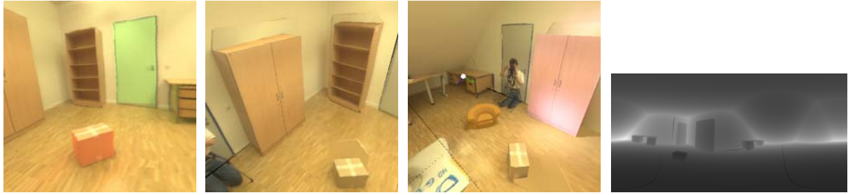
Figure 5: First image: The material of door and box are changed. The resulting color bleeding can be calculated in 0.3 - 1.0 seconds. Second image: The camera is moved to a new position. The environment texture is projected onto the geometry in the fragment program. The top of the furniture, parts of the wall and the area behind the box on the floor are not visible in the light probe image. These areas are filled with the algorithm described in (3.2). Third image: A combination of all possible manipulations. Right image: Omni-directional depth map.