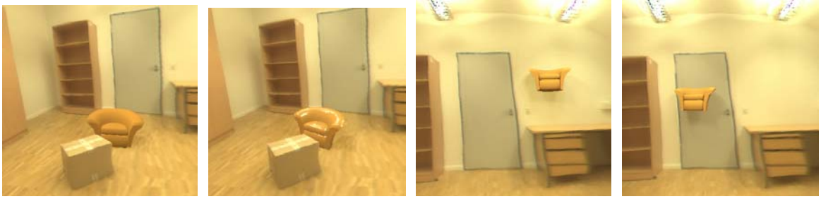
Figure 2: A virtual armchair, illuminated by 32 important light patches, is inserted. The second image shows the armchair with a floating-point reflection map. The images on the right show the virtual object and the light sources. The chair can be moved at 3..12 fps (32..2 important lights)